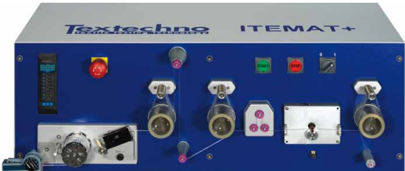
ITEMAT+ TSI with stability test in a single position housing

All ITEMAT+ versions are equipped with an active constant tension feeder at the yarn inlet to provide a precise pretension. This feeder compensates differences in yarn tension of the incoming yarn, which might influence the sensor reading.