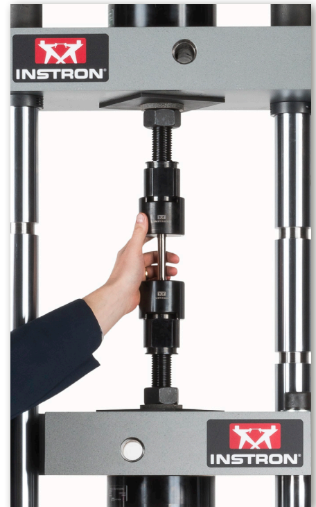
300DX-G1 with Tension Rods and Split Insert Tensile Grips for Testing .505 Specimens

W-1338-A 300DX Basic Kit W-1338-B 300DX Recommended Kit W-1338-C 300DX Comprehensive Kit W-1337-A 600DX Basic Kit W-1337-B 600DX Recommended Kit W-1337-C 600DX Comprehensive Kit