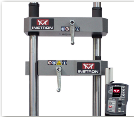
G1 - Closed with Manual Crank and Pinion