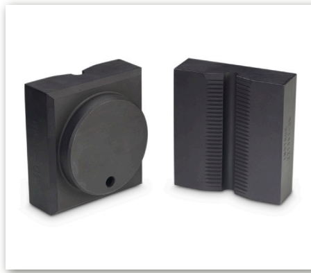
G7 Style Jaws for Round Specimens