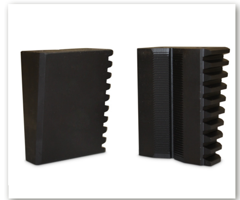
G1 Style Jaws for Round Specimens