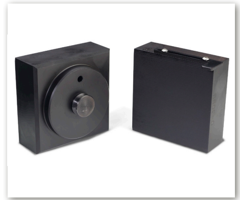
G7 Style Jaws for Flat Specimens