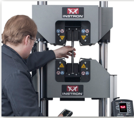
G7 - Open Front with Hydraulic Actuation