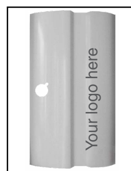
Panels can be customized in dozens of different ways, such as adding your company's logo.