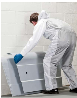
The Q-PANEL automotive refinish training system is a cost-effective simulation of hoods and fenders.

In addition to our standard corrosion panels, we can also make types and sizes not shown in this specification bulletin, in a variety of shapes, alloys and finishes. This includes curved, bent, grit-blasted, welded, embossed, perforated, and other options. Contact Q-Lab with your custom corrosion coupon specifications now!