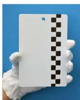
A variety of different pre-painted, patterned and other custom panels can be made upon request.