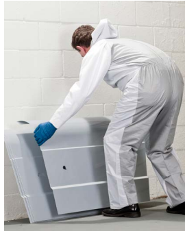
The Q-PANEL automotive refinish training system is a cost-effective simulation of hoods and fenders.

These custom panels are most cost-effective when there are quantities sufficient to allow an economical production run, and when the material is available from our stock metal or readily available alloys. Contact Q-Lab with your custom panel specifications now!