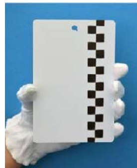
A variety of different pre-painted, patterned and other custom panels can be made upon request.