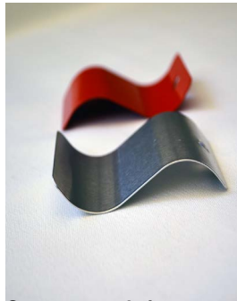
Custom panels in complex shapes can be created with a small minimum order side.