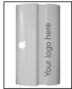
Panels can be customized in dozens of different ways, such as adding your company's logo.