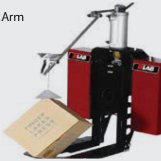
Package Support Arm