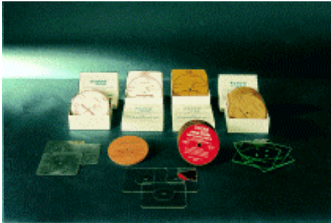
Taber® Abrading Wheels & Wearasers™