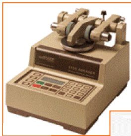
Taber® 5135 & 5155 Rotary Abrasers