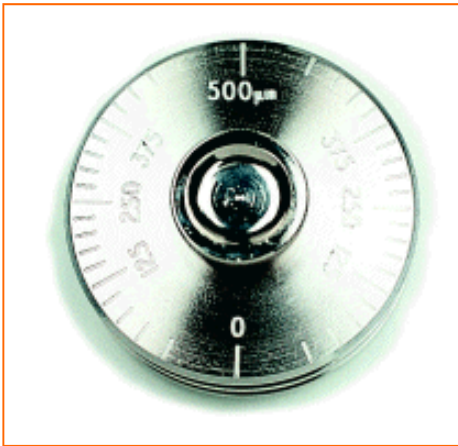
Elcometer 3230 Wet Film Wheels