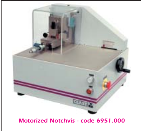
Motorized Notchvis - code 6951.000

code 6816.000 - 6955.000 - 6951.000 - 6950.000 - 6964.000