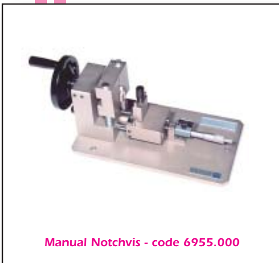
Manual Notchvis - code 6955.000