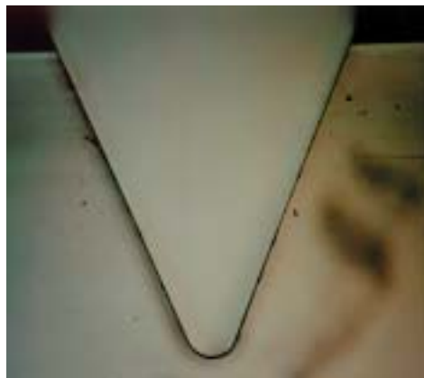
Detail of a notch obtained on ABS specimen using Automatic Notchvis. (The quality of the notch is evident)