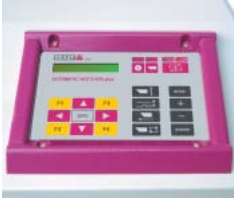
Soft-touch keypad to set up parameters