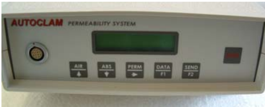
Fig. 2 Front panel of the control box

The electronic control box contains all the custom designed electronic control and recording hardware. On its front panel (Fig. 2) is a back-lit digital liquid crystal display screen, test selection keys, a reset key, and a twelve pin circular socket to connect to the Autoclam base unit.