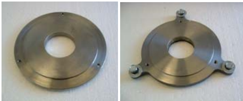
Fig. 1b Bonding type ring