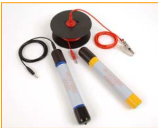
Elcometer 331 2 Half-Cell Kits

Elcometer 331 2 Covermeters with Half-Cell allow users to not only identify the location, orientation, depth and diameter of stainless steel rebar, but also the potential for corrosion all in one easy-to-use gauge.