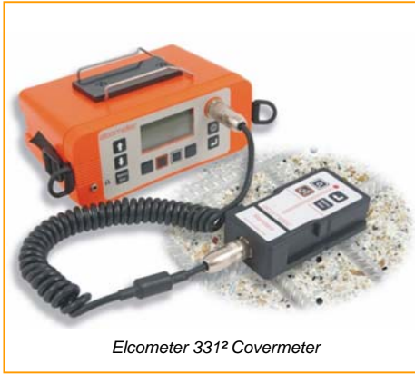
Elcometer 331 2 Covermeter